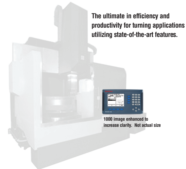
1000 image enhanced to increase clarity. Not actual size

The ultimate in efficiency and productivity for turning applications utilizing state-of-the-art features.